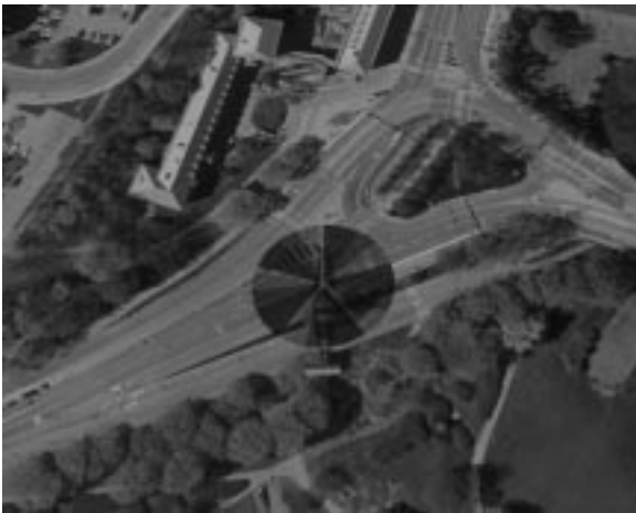
Figure 5. Pseudo-Virtual Simulation over Stockholm

simple road network with a number of intersections and a bridge and tunnel (see figure 4). The static virtual world was constructed using MultiGen and the simulation was rendered on an SGI Onyx machine. This virtual environment was set up to experiment with the deliberative and reactive components in the architecture, plan generation and prediction, chronicle recognition, and vision system recovery from tracked vehicles occluded by physical obstacles such as the tunnel.