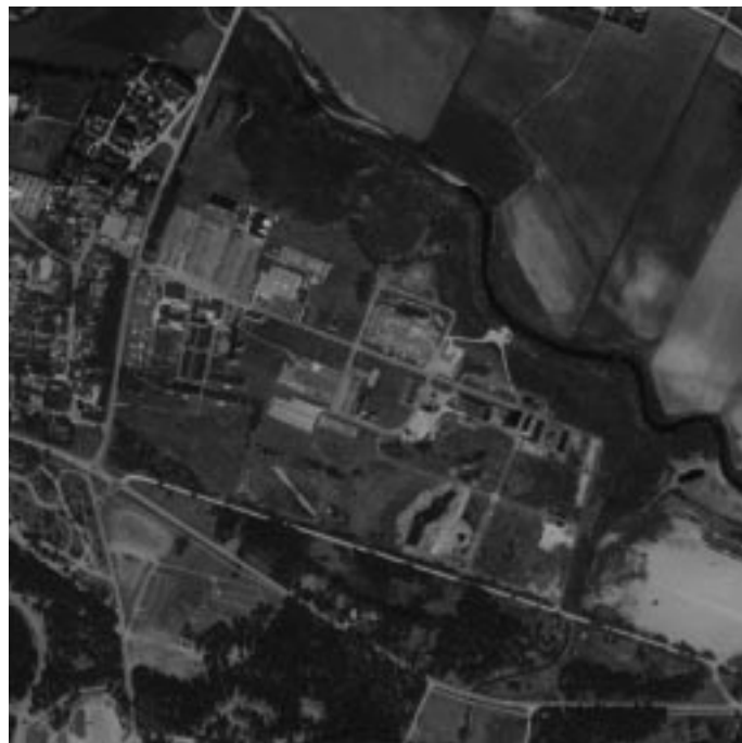
Figure 2. Fly-by: Revinge, Sweden

Revinge is an area near Lund in southern Sweden that contains a Rescue Services Training School. It contains a small town, roughly 1 km 2 , with asphalt and dirt roads and a number of different types of building structures ranging from single to three-storied buildings. The town is fenced in and provides an ideal location to do actual flight experimentation without endangering third parties. One disadvantage is the distance from our university (4 hours) and the fact that