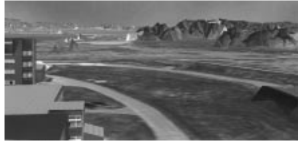
Figure 6. Enhanced Pseudo-Virtual Simulation over FOA and Linköping University

Purely simulated worlds are helpful, but not much of a challenge for the image processing capabilities of the vision system. In the next stage, we did some experimentation with the use of mosaics of digital images as textures in the virtual environment and super-imposed virtual vehicles on the road system in the digital photos. As the helicopter flew over the environment and pointed its emulated camera, the sequence of rendered image frames as viewed from the camera was fed into the vision system and processed. This modification imposed more realistic challenges and additional complexity for the image processing capabilities of the vision system (see figure 5).