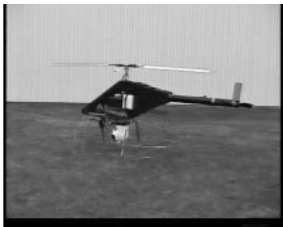
Figure 1. Scandicraft Systems APID Mk III.

We are currently investigating and considering purchase of one or more Yamaha RMAX Aero Robots, a VTOL system developed by Yamaha Motor Company Ltd., Japan [10]. The dimensions of the RMAX are similar to those of the APID, but the RMAX is in production and allows for a larger practical payload of roughly 30 kg which will be required for our new camera housing and on-board system. The production version of the RMAX is currently intended for use as a remotely piloted vehicle and is not autonomous, although an autonomous version is in the works and a prototype has recently been demonstrated.