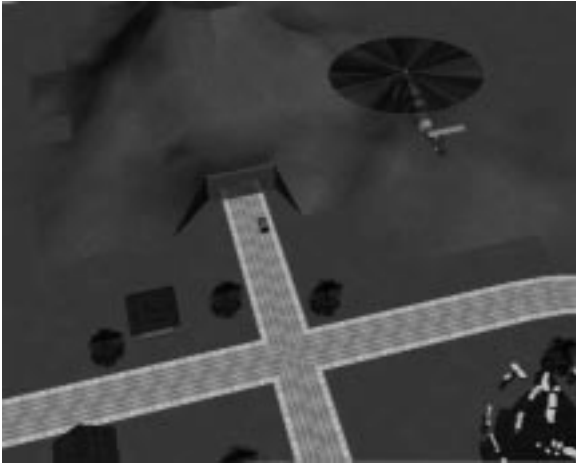
Figure 4. Virtual Simulation; Traffic/Tunnel Scenario.